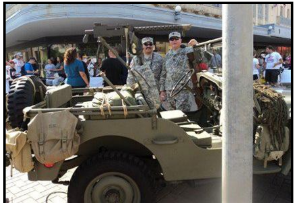
Over 500 runners, and thousands of patriots all packed the Alamo Plaza for the 10 th Anniversary of September 11 th , 2001