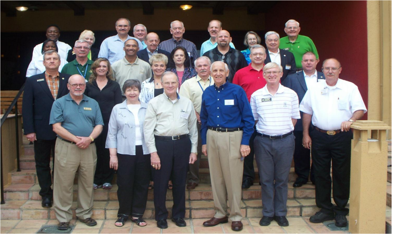
AUSA Chapter Leaders from a four state area gathered in San Antonio, 25-27 March 2011 to share best practices and receive updates from AUSA Headquarters visiting from Washington, DC.