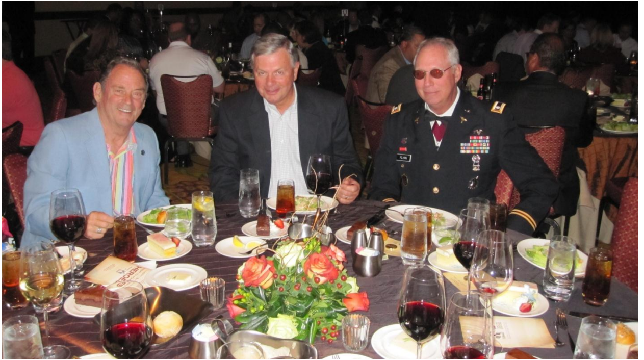
NIGHT TO HONOR MILITARY HEROES.